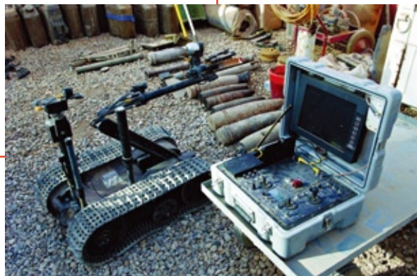
The TALON combat-ready robot, developed from platforms funded by several DARPA SBIR Awards